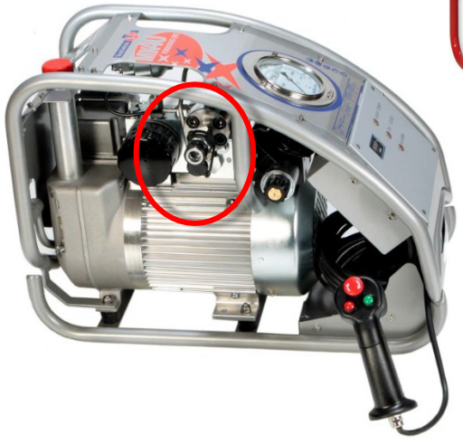
The XP-2000 intensifier