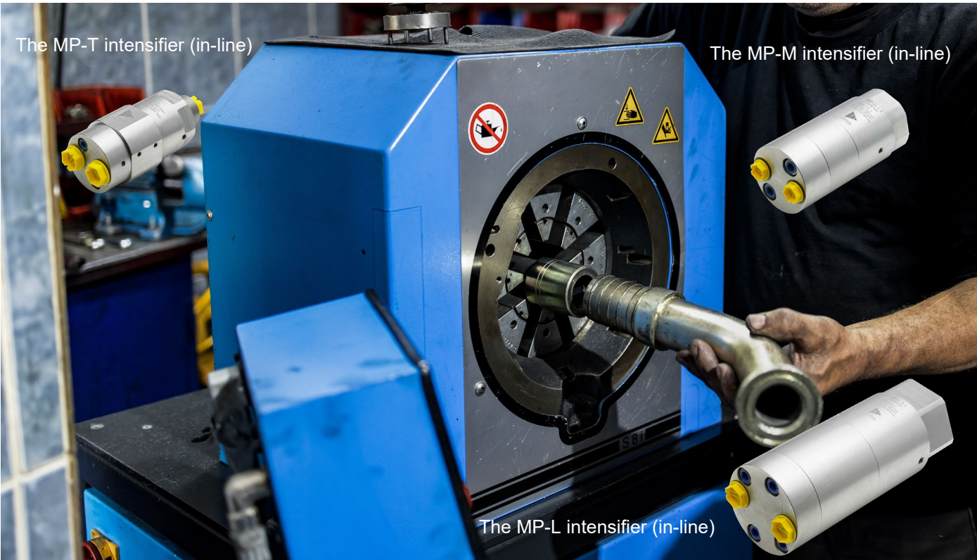
The MP-L intensifier (in-line)